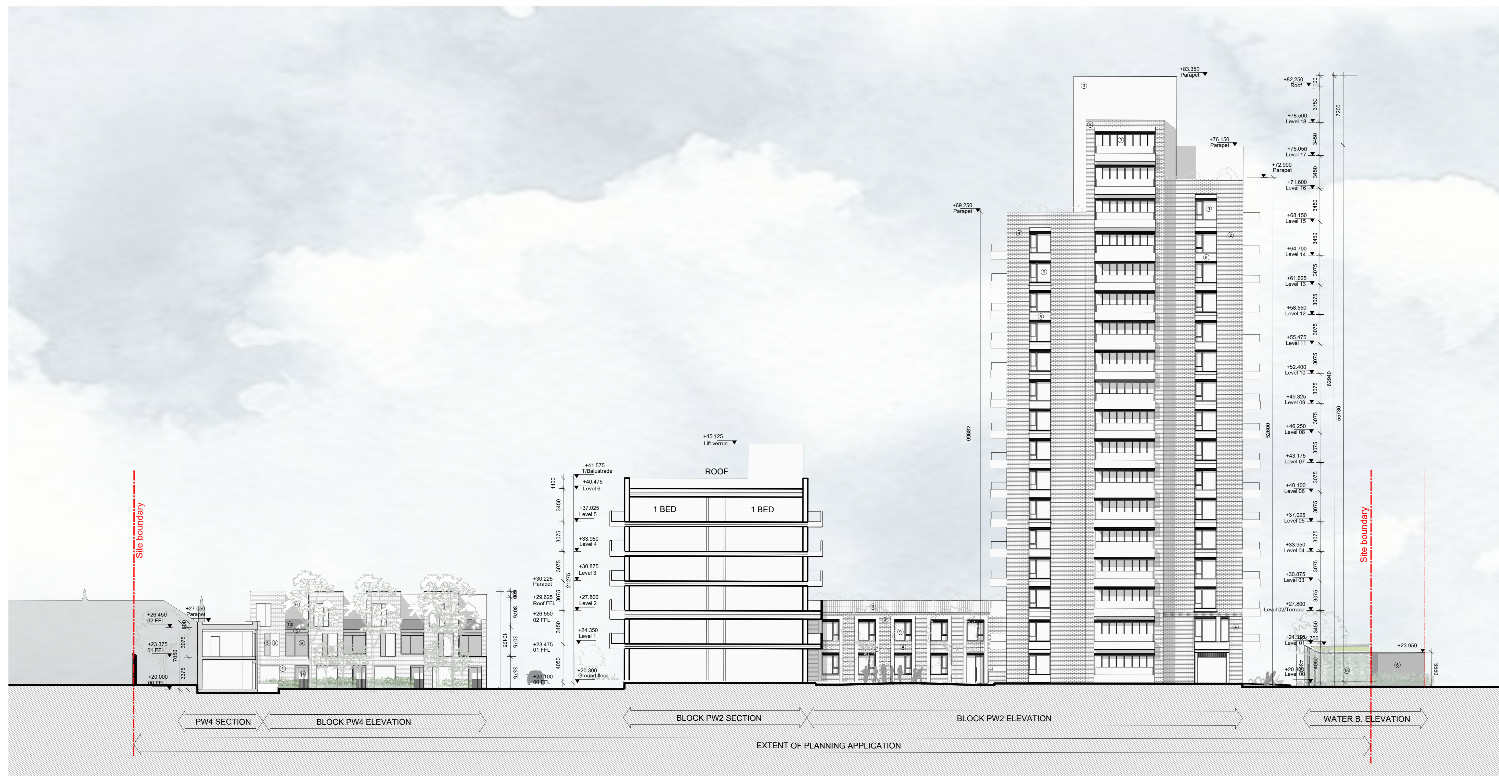
01 Section E Player Wills Site SCALE 1:200